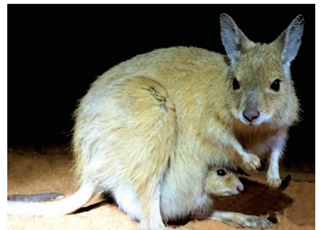
Photos: Newhaven Wildlife Sanctuary, Central Australia (top), Numbat (middle), Mala and baby (bottom).