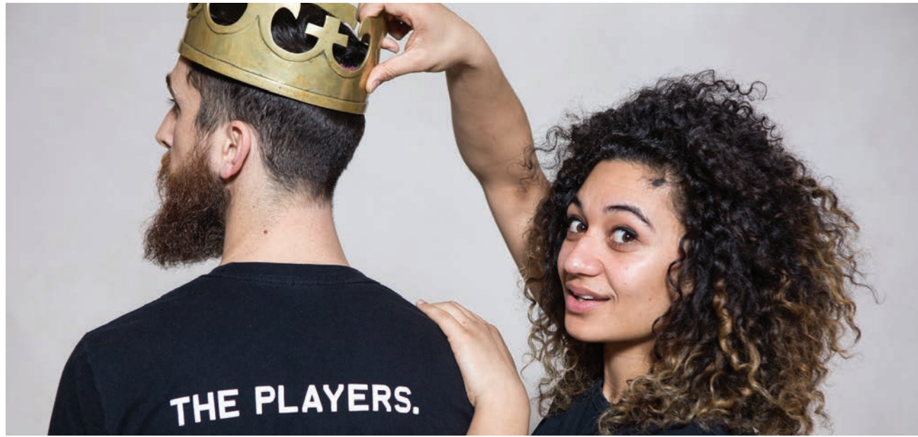
Bell Shakespeare Education Campaign.