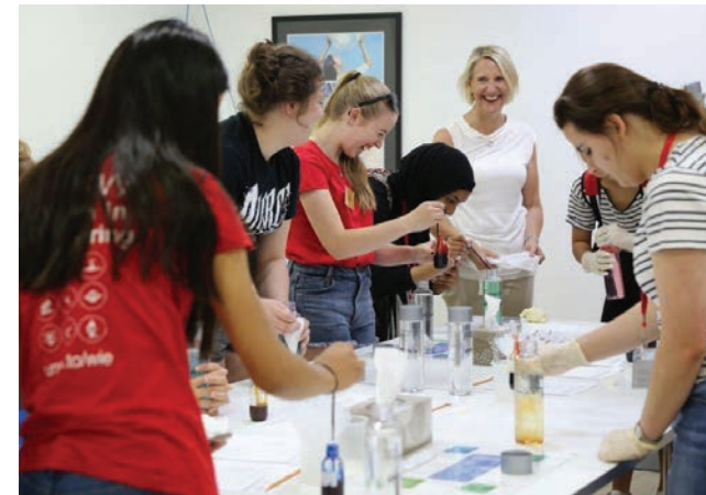
UNSW's Women in Engineering program reaches out to young women during their school years.