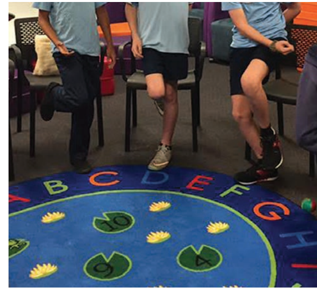
Eternity Aid's Taree Project focuses on children and young people building their own resources to excel in education and life.

Eternity Aid has not by-passed the Taree community. The Taree Project aims at addressing rates of youth incarceration. Following the success of our programs in Bourke, we have identified Taree and its high rates of youth in custody, as the focus of this project. The work also aims to help all children and young people build their own resources so that they can have the ability to excel in education and life.