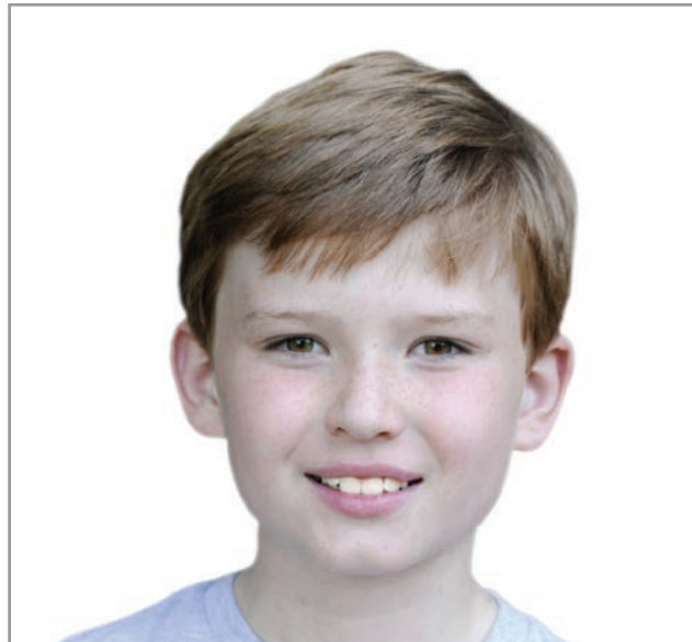
Supporting each other in search for a cure.

“I enjoyed talking to others who have similar conditions. Knowing what they are going through, I can relate to them and I gain as much info from them as I hope they do from me.” AMDF Support Teleconference Participant.