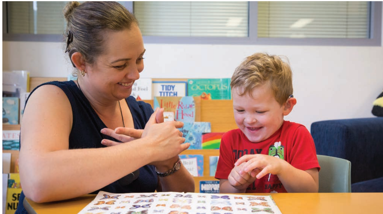
Open-plan spaces to accommodate learning through play, helped by the development of an Acoustic Assessment Program.

The Royal Institute for Deaf and Blind Children (RIDBC) provides education, therapy, and cochlear implant services for children and adults with vision or hearing loss, their families, and the professionals who support them.