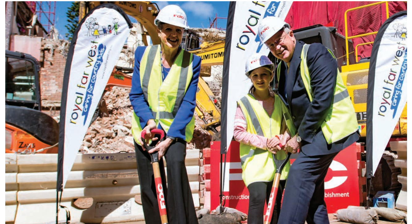
Construction starting on Royal Far West Centre for Child Health and Learning, Manly.

Royal Far West has been working with Australian country communities for over 90 years, to improve the health and wellbeing of children and young people who live in rural and remote areas.