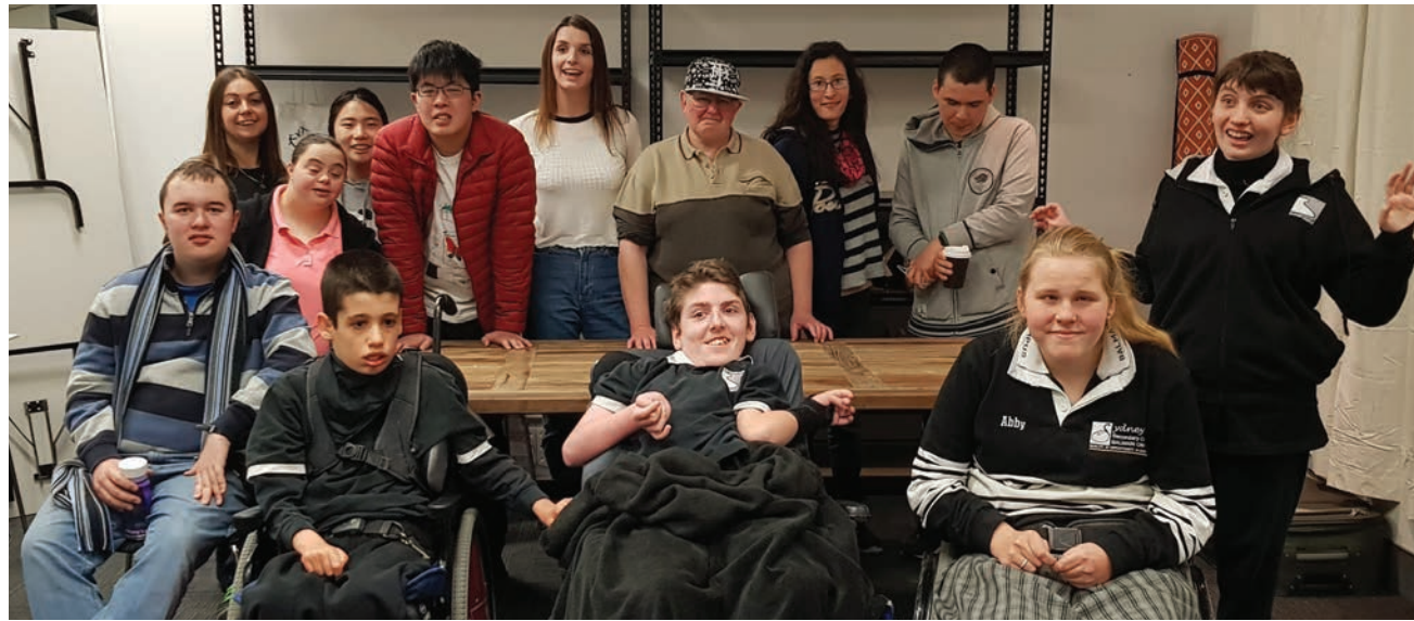
Harnessing the skills and abilities for social and ethical products at the Avenue workhub in Botany.

Fighting Chance designs, builds and scales social enterprises which move the dial for Australians with disability and their family. Our mission is to ask ‘WHAT IF?’, to see the world as it isn’t yet, to imagine a future quite different to the present. And then to make it happen.