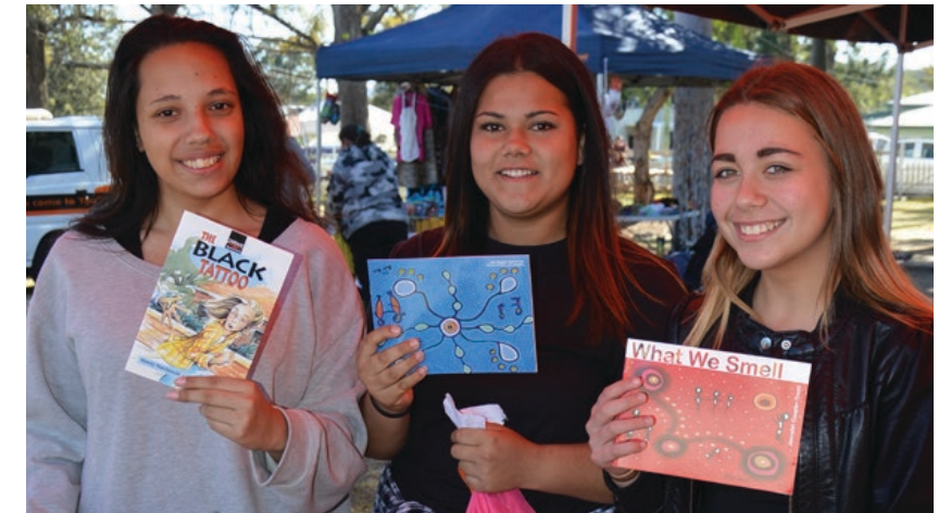
Motivating students to want to learn to read.

Long experience of tutoring indigenous students has taught us the value of small groups or one on one tutoring. Securing experienced aboriginal tutors, those with ATAS registration or similar is particularly difficult.