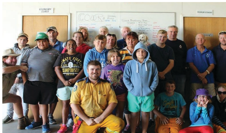
Parenting programs at Wellington Correctional Centre, NSW.

One of the most vulnerable groups in the community is without doubt those children whose mothers are in prison, especially in rural and indigenous communities. These children not only face the trauma of losing the most important figure in their young lives, but also suffer attachment and self-esteem issues which affect their development and ability to learn and form future relationships. Many mothers of these children, have been incarcerated for relatively minor infractions brought about by entrenched social disadvantage.