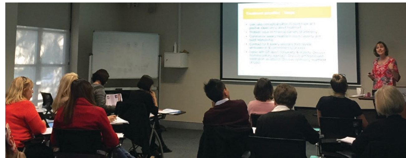
Face-to-face health professional training workshop.

Caring for the mental health of people in remote and rural areas can be particularly challenging, with mental health issues in rural Australia both widespread and significant. In a rural context, there is a lack of suitably trained health providers and available services, as well as a pressing need to ensure that rural GPs and allied health professionals have access to clinically relevant, high quality face-to-face training, to be able to diagnose, treat and manage common mental health problems within their communities.