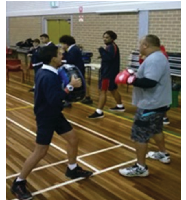
Positive Attitude Changes Everything.