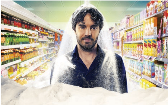
Creating a vibrant interactive online hub for That Sugar Film's Schools Program.

In mid-2015 the James N. Kirby Foundation generously provided a grant to support That Sugar Film's schools outreach program. School-aged children consume around 35% of their total daily energy intake from food and beverages consumed on school premises. Most schools operate a canteen or tuckshop and many have on-site vending machines, making them the largest takeaway food network in Australia.