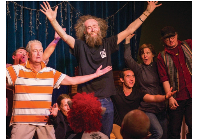
THE LAST LAUGH

Milk Crate Theatre works with an Ensemble of artists who have experienced or are at risk of experiencing homelessness. The organisation provides a safe, creative space for the Ensemble to build confidence and make positive changes in their lives. Australians experiencing homelessness are often excluded from participating in social, recreational, cultural and economic opportunities in their community. Milk Crate Theatre aims to create social inclusion through sharing and valuing real stories and experiences.