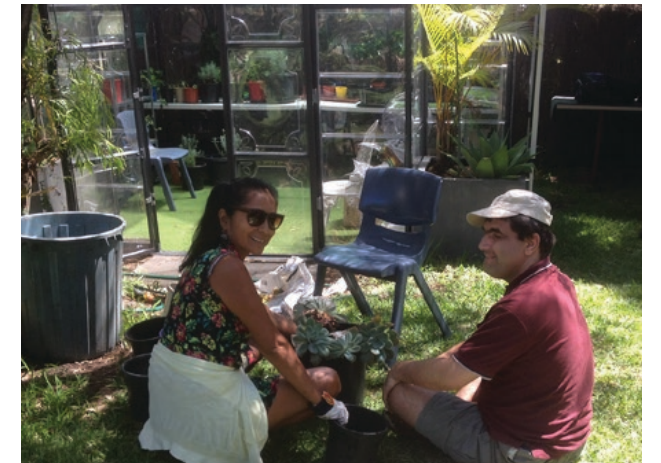
ENJOYING THE GREENHOUSE