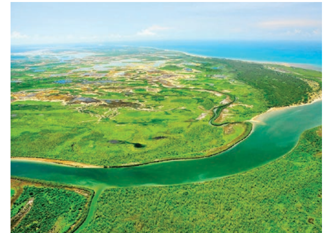
CALVERT RIVER, PUNGALINA, SEVEN EMU WILDLIFE SANCTUARY.

In 2009 the James N. Kirby Foundation generously contributed towards the acquisition of Pungalina-Seven Emu Wildlife Sanctuary by Australian Wildlife Conservancy (AWC) in the remote Gulf of Carpentaria. Now, with the Foundation's continued support, we are completing the next major step in conserving this stronghold for threatened wildlife: establishing the only stretch of feral herbivore-free coastline on the Gulf of Carpentaria. An 80,000 hectare feral herbivore-free area is now being created through the construction of a 43km fence that stretches from the Gulf coast to the sandstone escarpment on Pungalina.