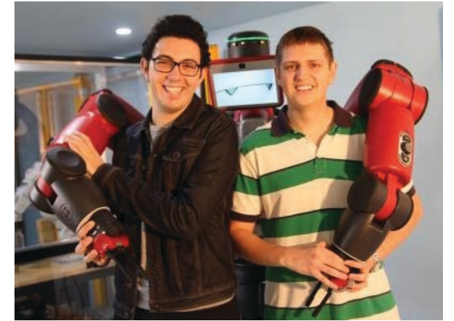
BUNTING WITH BAXTER IN THE LAB