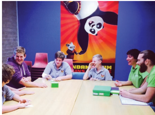
JUNIOR TOP BLOKES IN ACTION

The Top Blokes Foundation was fortunate to receive a $10,000 grant from James N. Kirby Foundation to deliver the Junior Top Blokes School's Mentoring Program to 131 young males.