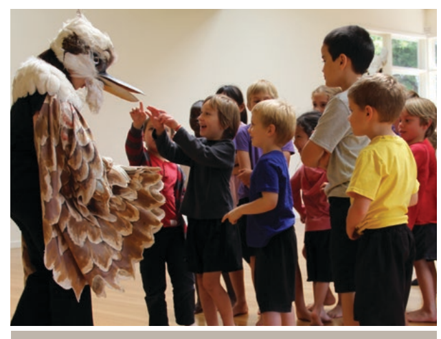
A MEMBER OF THE AUSTRALIAN BALLET'S DANCE Education Ensemble in Costume with Students.

As Australia's national dance company, The Australian Ballet is committed to supporting the teaching of dance in our schools and to create future audiences for the art form.