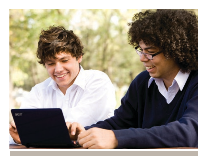
TECHNOLOGY WITHIN COMMUNITIES

The eSmart program is a behaviour-change initiative of The Alannah and Madeline Foundation. This initiative is a world first, online system that helps schools deal with the serious issues of bullying, cyberbullying and cybersafety. Being eSmart means equipping schools with the knowledge, resources and support to promote the smart, safe and responsible use of technology within their communities.