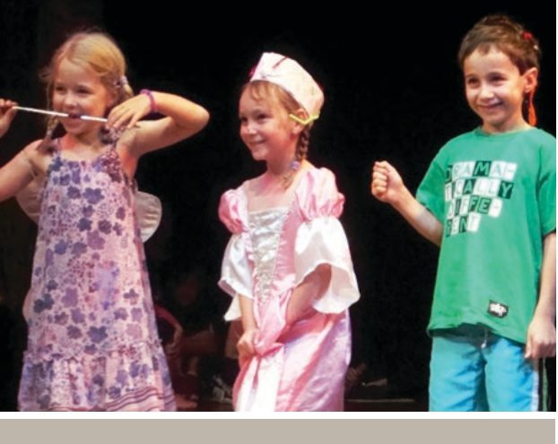
Performing Arts Experience