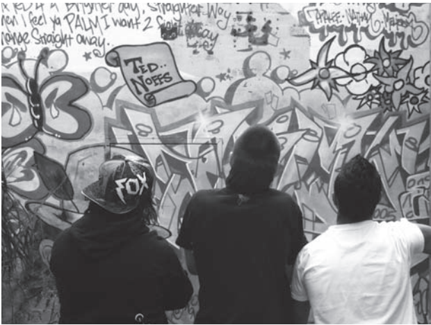
THOUGHT PROVOKING THEATRE

The Ted Noffs Foundation supports young people at risk of substance abuse and mental health issues, and their families. We care for these young people through a number of means including, life-management programs, residential rehabilitation services, school counselling and out-reach services, and through the Street University - a free centre which engages young people in educational, recreational, and arts-based programs.