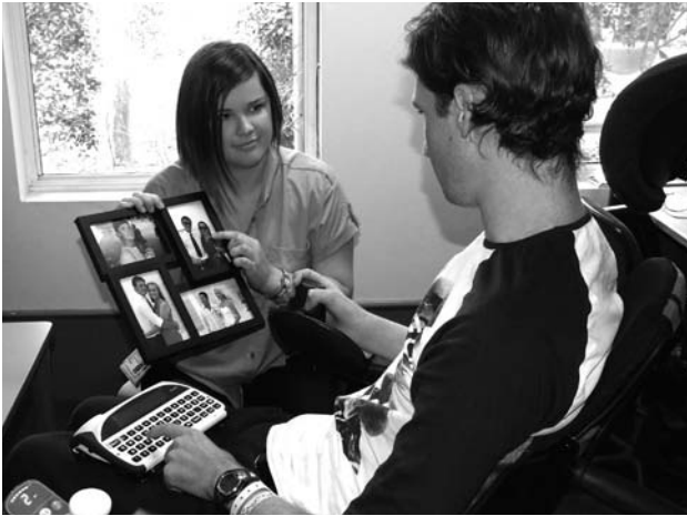
USING THE KEYBOARD TO IDENTIFY AND SPEAK THE NAME OF FRIENDS FROM PHOTOS

The Royal Rehabilitation Centre has six specialist units and two of these units use the revolutionary “Lightwriter” equipment. The units are brain injury and stroke.