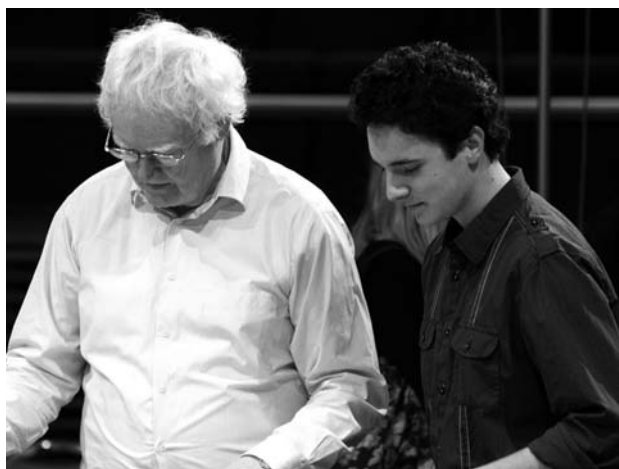
LIFE-CHANGING EXPERIENCES FOR STUDENTS