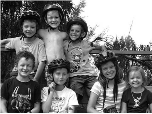
FAMILY CAMP - NSW

The annual family camp was held from Friday 19 November - Sunday 21 November at NSW Academy of Sport, Narrabeen. This was a great experience for the children with haemophilia and other rare inherited bleeding disorders and for their siblings and parents.