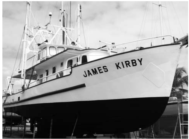
THE RESEARCH VESSEL JAMES KIRBY

This internal refit would provide some new basic facilities for crew to enable trips of extended duration to capitalise on the cutting edge technology JCU has currently invested.