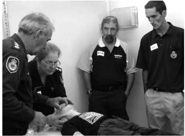
TRAUMA TRAINING COURSE