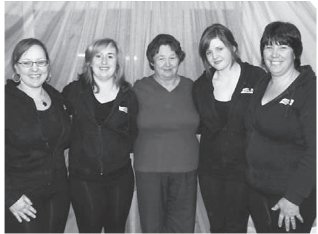
NORTHSIDE DANCE STUDIO TEACHERS