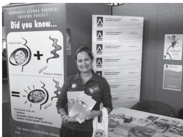
PARENTS, BABIES AND CHILDREN'S EXPO

The Asthma Foundation of Western Australia is a community based, non-profit organisation dedicated to the alleviation of asthma as a cause of morbidity and mortality in our community. The Foundation has a range of educational and support services to help people with asthma, along with their carers. The Asthma Foundation of WA is also home to various important projects including the Newborns Asthma Parental Smoking (NAPS) Project, Asthma Friendly Schools project, Adult Asthma Swim and the Triple E program for school aged children.