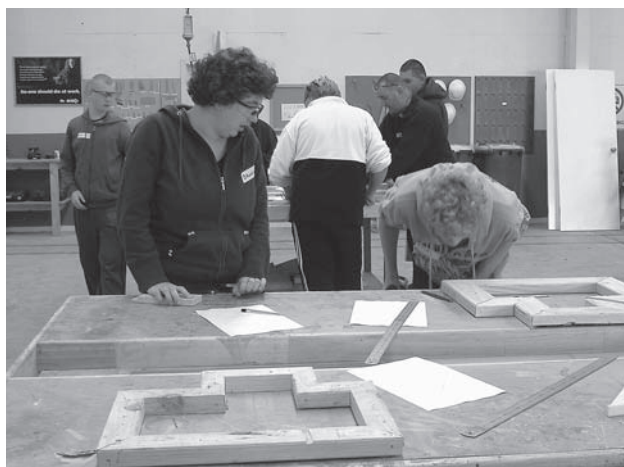
DEVELOPING SKILLS THROUGH SPECIALISED PROGRAMS

Yooralla is Victoria's oldest and largest not for profit community service provider's. We actively support people with disabilities, their families and carers to live the life they choose.