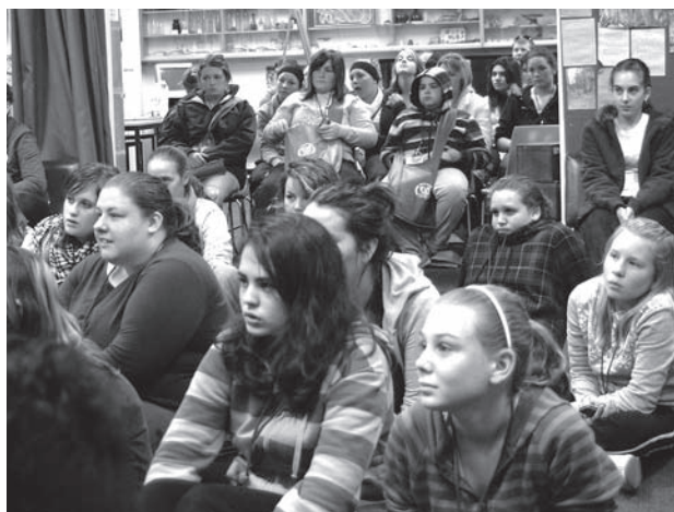
REACHING THE RURAL COMMUNITIES