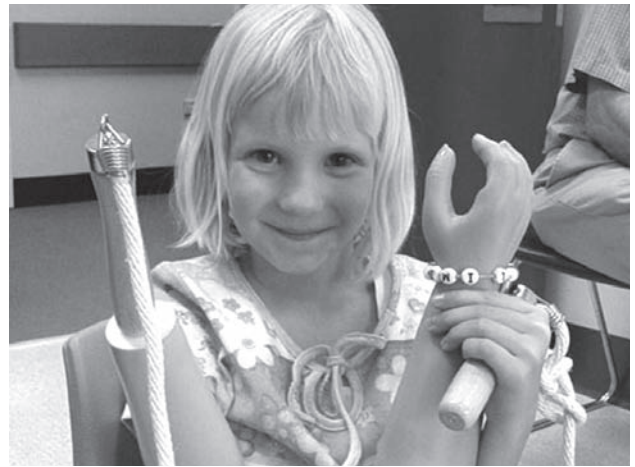
A MYOELECTRIC ARM

The very generous gift of $10,000 from the James N. Kirby Foundation to Variety during 2009 has ensured a child received a brand new Myoelectric arm earlier this year.