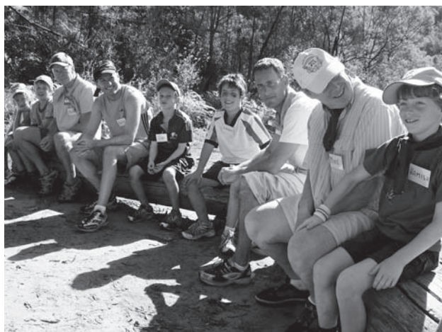
FATHERS AND SONS ON THE YOUNGSTARS PROGRAM

Pathways believes it is vital that good parenting and healthy self esteem go hand in hand and should be implemented in the formative, early years of our children's lives to ensure our youth remain positive about their future and achieve to their highest abilities.