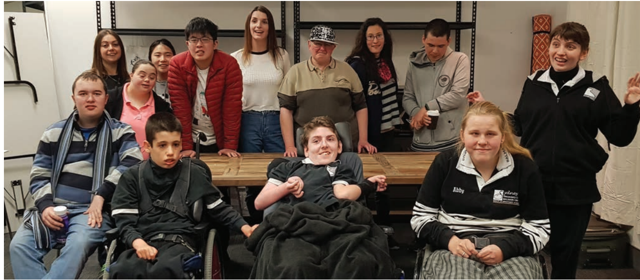
Harnessing the skills and abilities for social and ethical products at the Avenue workhub in Botany.

Fighting Chance designs, builds and scales social enterprises which move the dial for Australians with disability and their family. Our mission is to ask ‘WHAT IF?’, to see the world as it isn’t yet, to imagine a future quite different to the present. And then to make it happen.