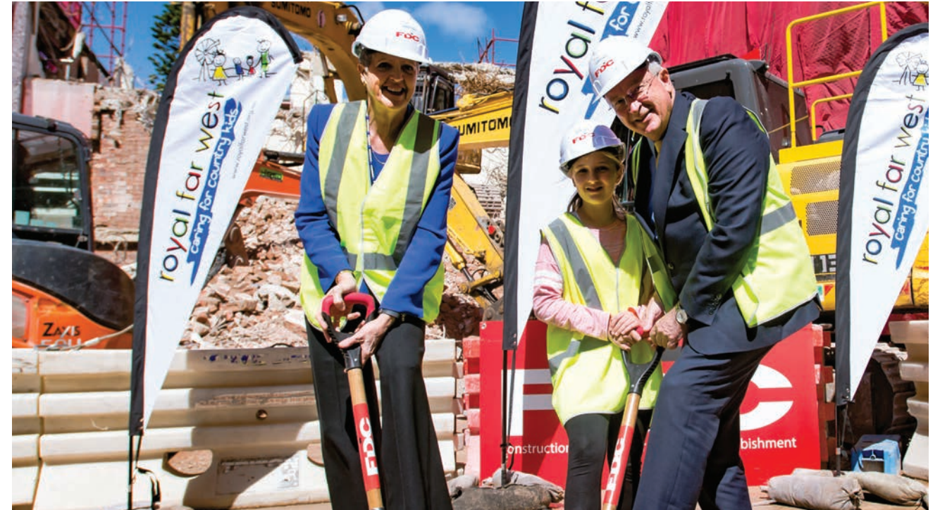
Construction starting on Royal Far West Centre for Child Health and Learning, Manly.

Royal Far West has been working with Australian country communities for over 90 years, to improve the health and wellbeing of children and young people who live in rural and remote areas.