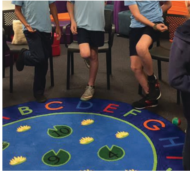
Eternity Aid's Taree Project focuses on children and young people building their own resources to excel in education and life.

Eternity Aid has not by-passed the Taree community. The Taree Project aims at addressing rates of youth incarceration. Following the success of our programs in Bourke, we have identified Taree and its high rates of youth in custody, as the focus of this project. The work also aims to help all children and young people build their own resources so that they can have the ability to excel in education and life.