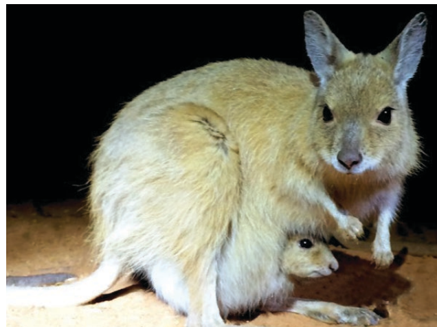
Photos: Newhaven Wildlife Sanctuary, Central Australia (top), Numbat (middle), Mala and baby (bottom).