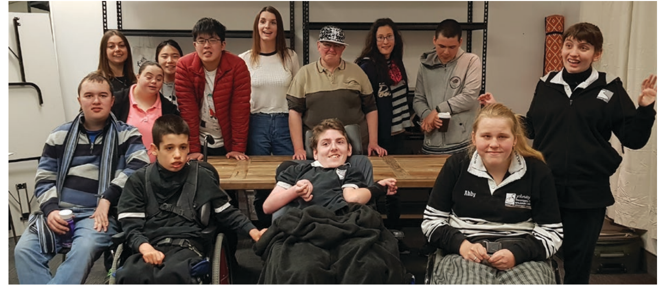
Harnessing the skills and abilities for social and ethical products at the Avenue workhub in Botany.

Fighting Chance designs, builds and scales social enterprises which move the dial for Australians with disability and their family. Our mission is to ask ‘WHAT IF?’, to see the world as it isn’t yet, to imagine a future quite different to the present. And then to make it happen.