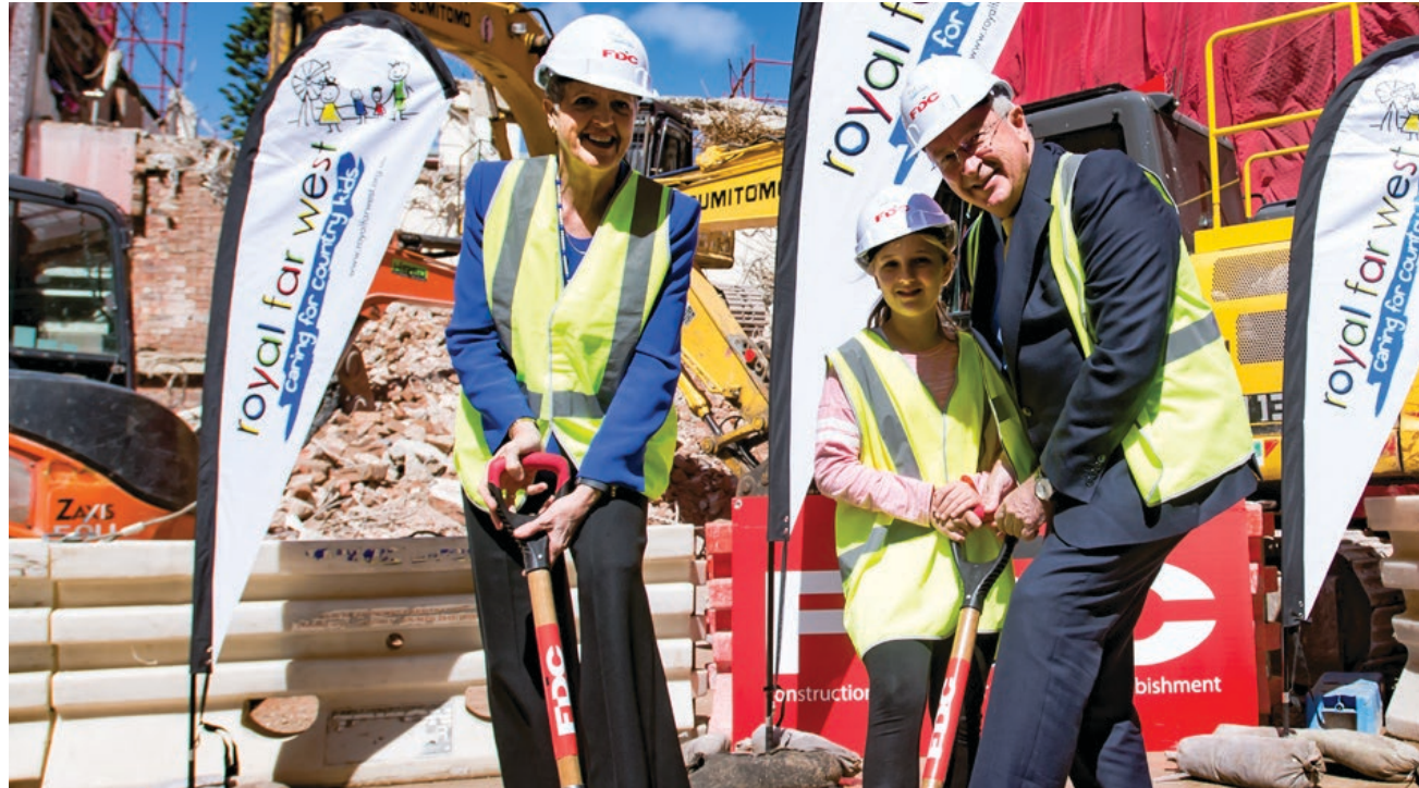
Construction starting on Royal Far West Centre for Child Health and Learning, Manly.

Royal Far West has been working with Australian country communities for over 90 years, to improve the health and wellbeing of children and young people who live in rural and remote areas.