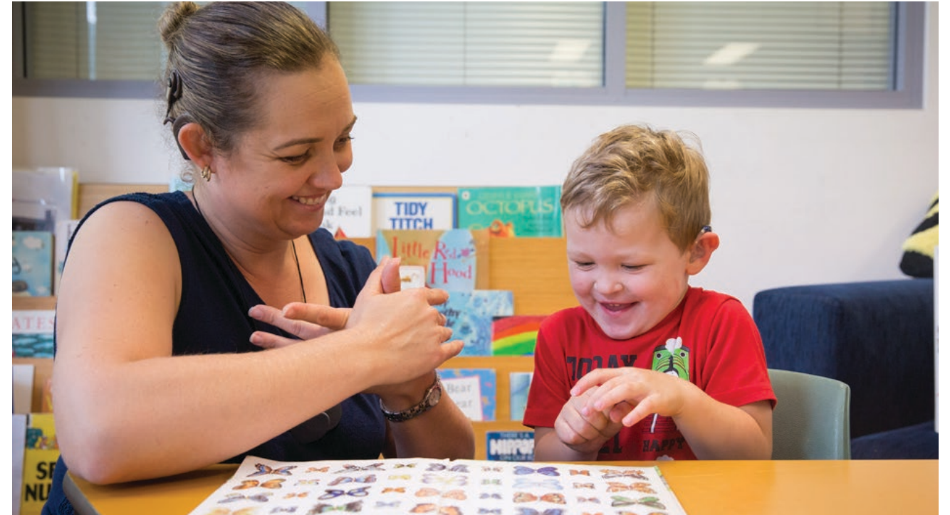
Open-plan spaces to accommodate learning through play, helped by the development of an Acoustic Assessment Program.

The Royal Institute for Deaf and Blind Children (RIDBC) provides education, therapy, and cochlear implant services for children and adults with vision or hearing loss, their families, and the professionals who support them.