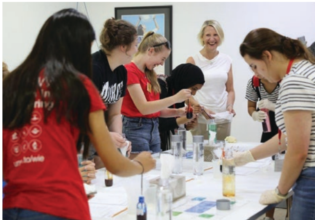
UNSW's Women in Engineering program reaches out to young women during their school years.