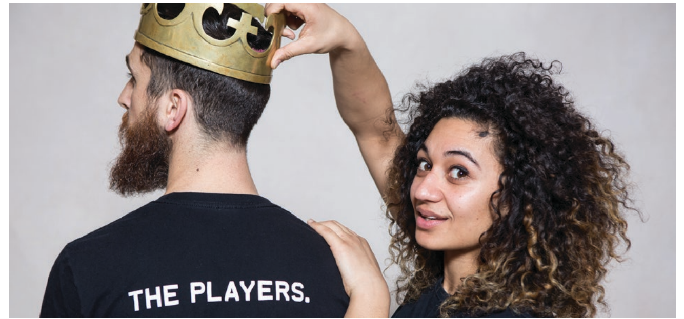
Bell Shakespeare Education Campaign.